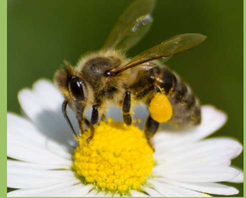
A honey bee collecting pollen from a daisy.

Note that “honey bee” is properly spelled as two words, even though many otherwise authoritative references spell it as one word.