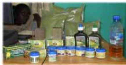
GPIs Moringa products