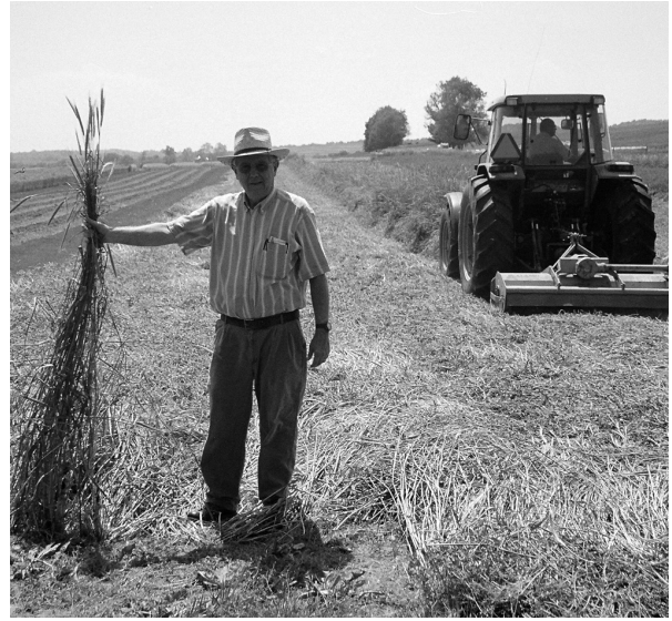
Figure 2. The roller-crimper (left) has been developed specifically for no-till management of high biomass cover crops. The flail mower (right) is a versatile tool, in that it can be used to generate even, finely chopped mulch, or can be operated with the PTO off to function as a roller, as shown here.

is important for mechanical no-till planting. Vetches, peas and soybeans grown in biculture with these other cover crops will regrow somewhat after rolling. This regrowth can be managed by mowing a week or two later. Research teams in Virginia, Pennsylvania and Alabama have developed roller-crimpers , specifically designed for mechanically killing cover crops. The crimping action reduces regrowth. Rolling can also be accomplished with a cultipacker, or a flail mower with the PTO off. Even a tractor-mounted rototiller, again with the PTO off, can flatten and orient a stemmy cover