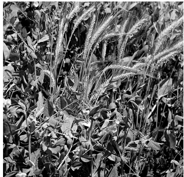
Figure 1. The triticale cover crop (left) has accumulated about 2.3 tons/acre biomass and does not completely cover the ground. Spring weeds will likely grow through its residues before a no-till vegetable can get established. No ground is visible through the vigorous biculture of triticale + Austrian winter peas (right), which has reached 4.8 tons/acre, and will provide an effective, weed-suppressive mulch.

in the alleys and traffic lanes to maximize between-row weed suppression and moisture conservation.