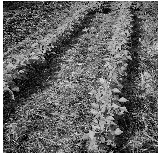
Figure 3. The No-Till Planting Aid (left) prepares a narrow slot in the soil for planting. This snap bean crop (right) was planted in August with a push seeder into furrows prepared with the planting aid. The cover crop residues helped the vegetable by conserving moisture during a hot, dry season.