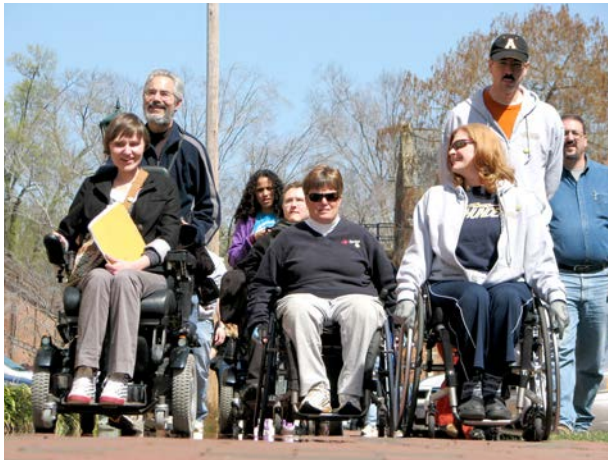
Park McArthur’s 2010 “Presence is Progress” project

Capture testimonials from people experiencing an arts event.