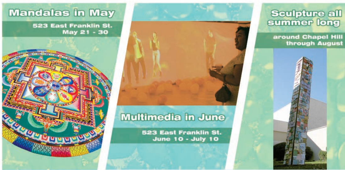
2011 Bus Card Promotion for Summer Cultural Arts Programs

Develop economic impact data and statements to demonstrate value of arts and cultural development.