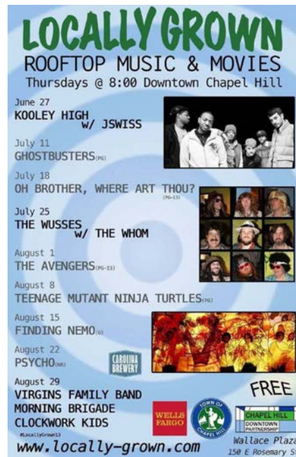
The 2013 Outdoor Entertainment Series “Locally Grown” held on the Wallace Deck Downtown

Collect information from residents and visitors.