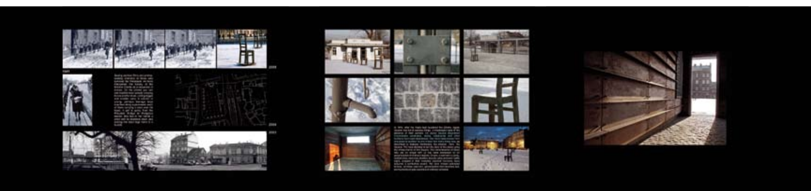
Top: New Zgody Square, remodelling of the Bohaterów Getta Square, Krakow, Poland, 2005. By Piotr Lewicki and Kazimierz Latak Developer: City of Krakow.