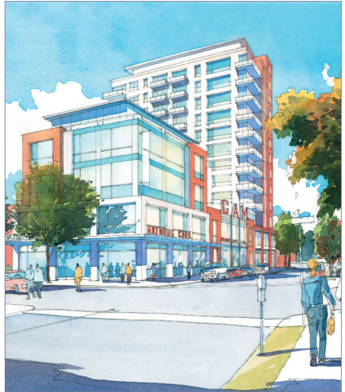
Plans for the new CAM (above) could include two new buildings to go along with the warehouse now on the museum's lot.

The project is Grubb's first development effort in Downtown Raleigh. The project could take 18 months to