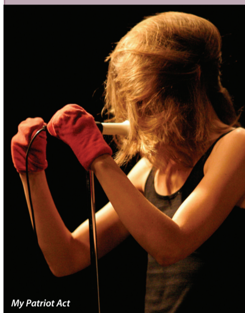
My Patriot Act