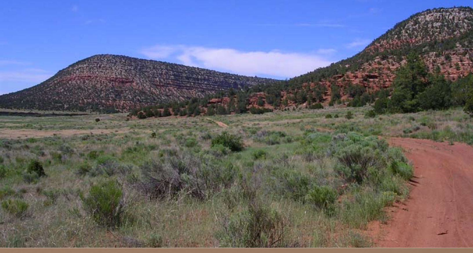
HB 273 would set more clear criteria for what qualifies for designation as a "state trail"